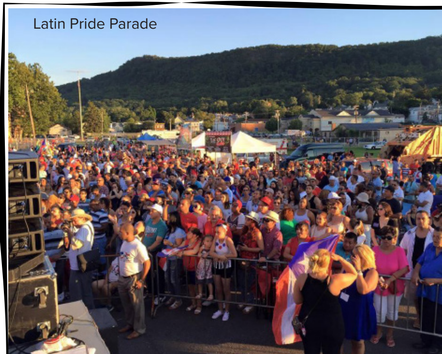
Latin Pride Parade