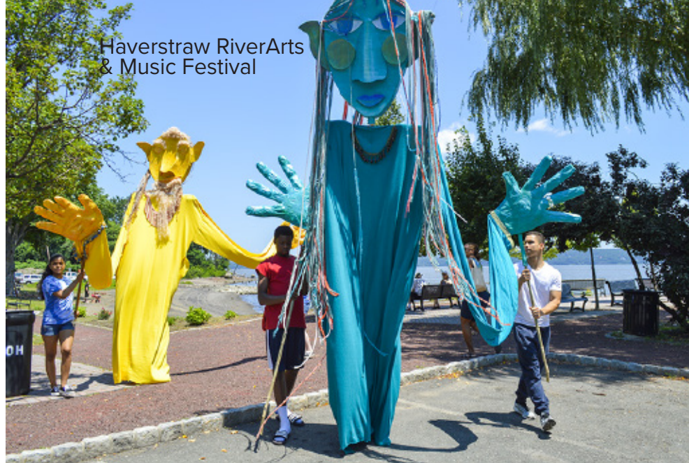
Haverstraw RiverArts & Music Festival