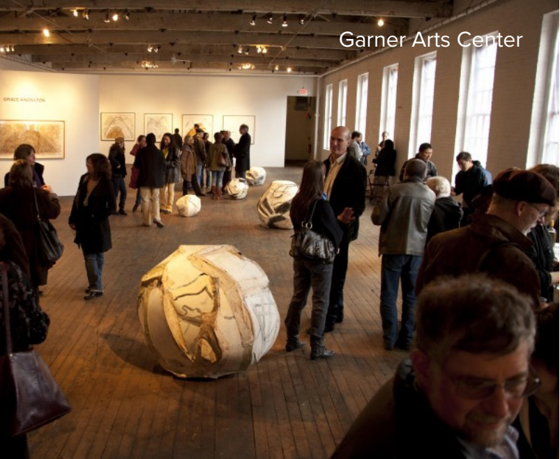
Garner Arts Center